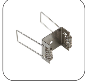
Mounting Clip (metal)